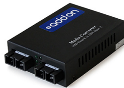
1000Base MM to SM Media Converter

ADD-MCC40GQSFP-SK ADD-MCC40GQSFP ADD-MFMC-SFP ADD-MFMC-LX-2SC