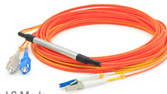
SC to LC Mode