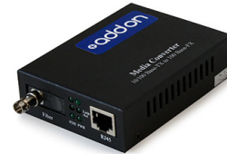
100Base-BX ST to RJ45 Media Converter