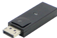
DisplayPort to HDMI Adapter Converter

DISPLAYPORT10F USB302VGA HDMIHSM15 DVID2DVIDSL15F MDISPORT2VGAMM3W