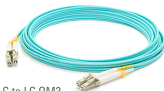
LC to LC OM3

ADD-MODE-LCLC6-1 ADD-MPO4LC20M50M3 ADD-ST-ST-10M6MMF