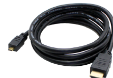
HDMI to Mini-HDMI Cable