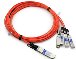
40G AOC Breakout