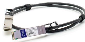
QSFP+ Copper Twinax