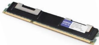
OEM Blade Server Memory

MB194G/A-AA 33L5040-AM 13N1524-AA 397409-B21-AM