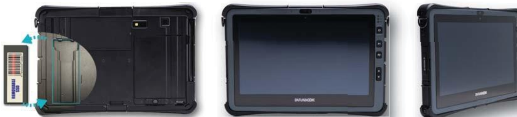
User Removable SSD

4. Actual weight may vary with on different configurations.